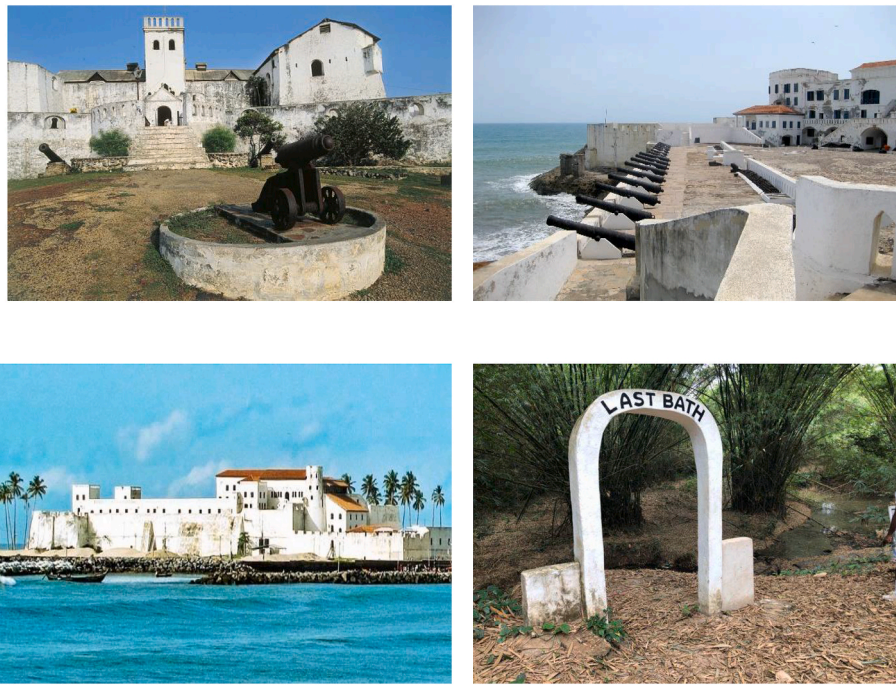
Fig. 2. Diaspora tourism places in Ghana.

their brief period of visit, the absence of official diaspora visitor arrivals statistics, and consequently the absence of reliable a sampling frame. This prompted the researchers to adopt a convenience sampling method for the main survey.